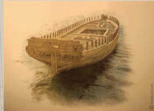
Reconstruction in 1987

In 1932 the rigging was changed from schooner to a ketch.