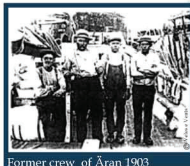
Former crew of Äran 1903

In 2015 the rehabilitation process is finished. All the necessary certificates are achieved so Goleta Äran can finally navigate on our coasts with 50 passengers aboard.